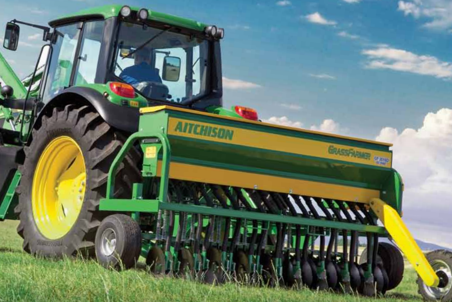
Disc version shown