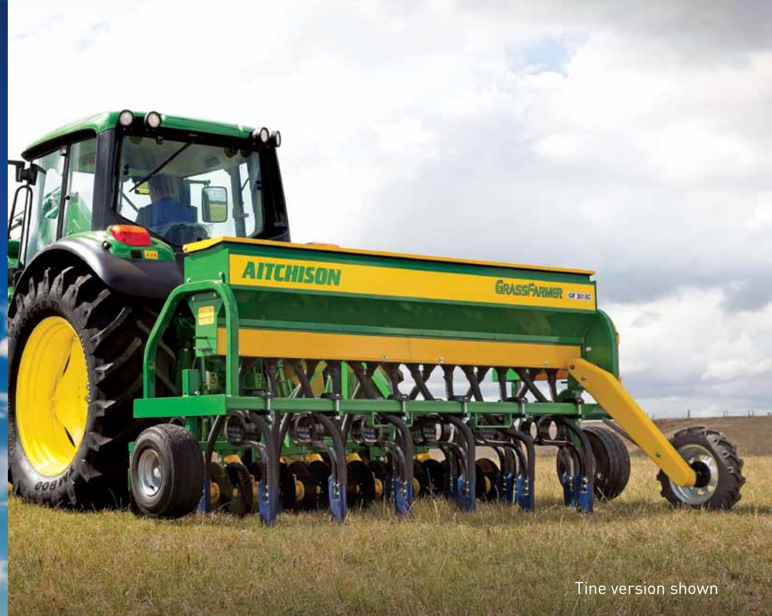
Tine version shown