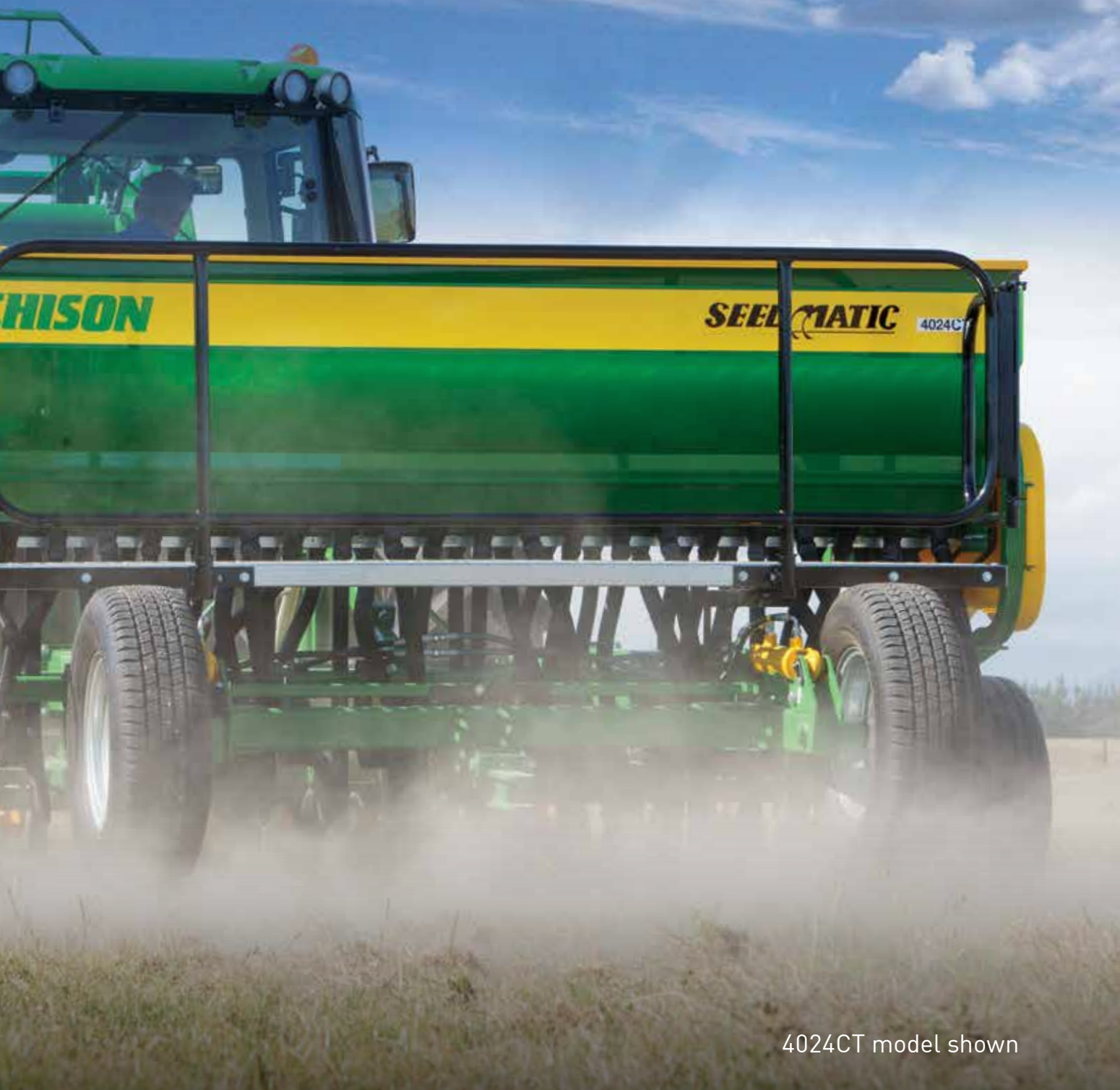
4024CT model shown

REAP THE BENEFITS EVERY TIME WITH THE SEEDMATIC® SERIES