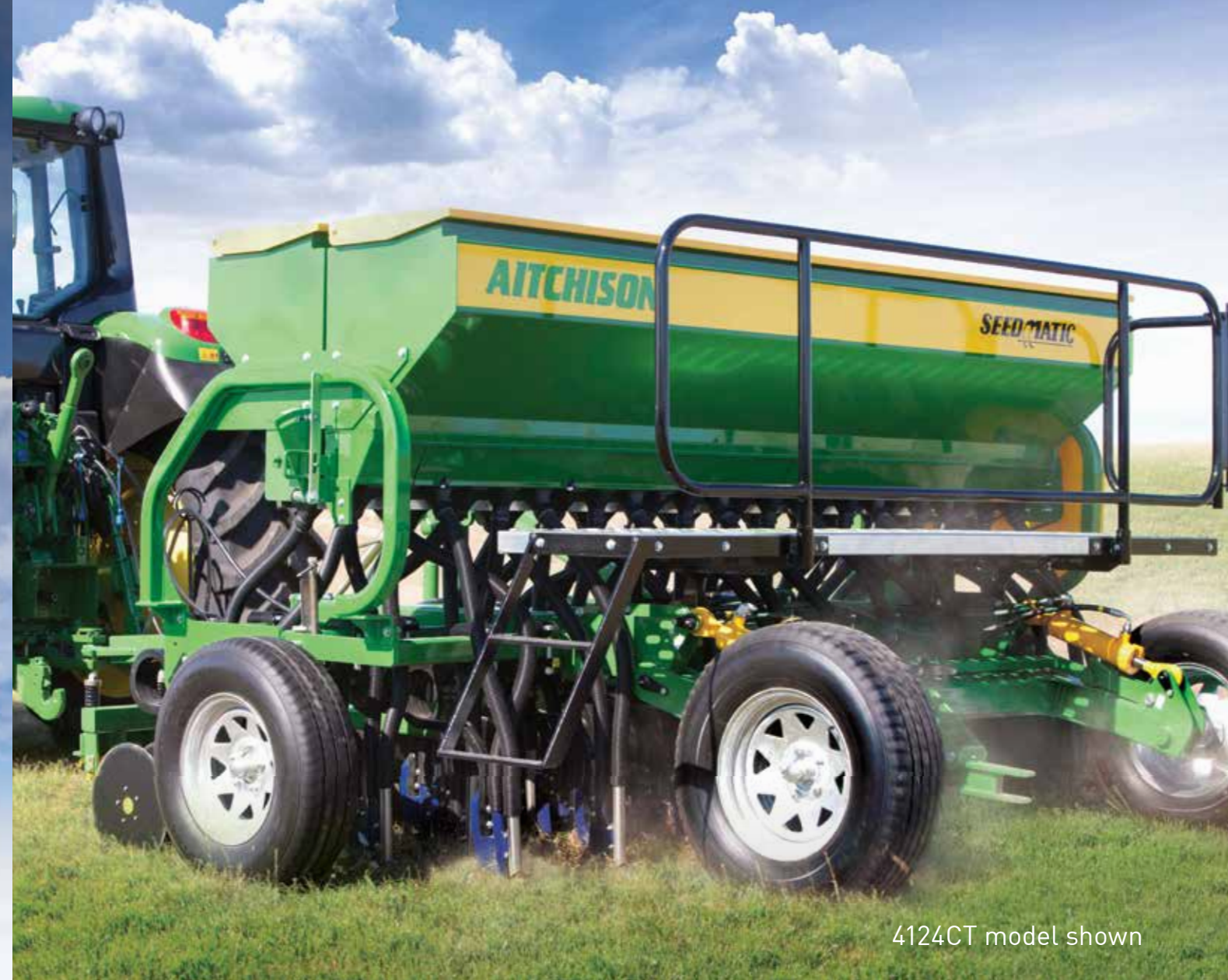
4124CT model shown